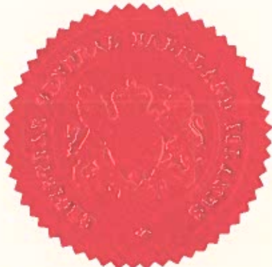
Registrar of Companies