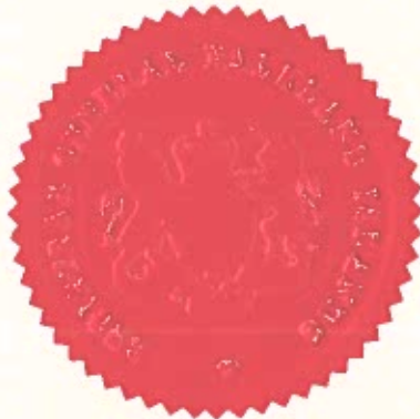
Registrar of Companies

Given under my hand and seal this 13th day of January 2005