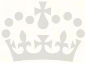
Registrar of Companies