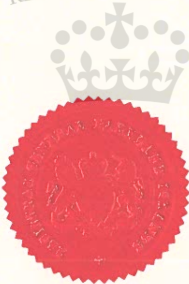
Registrar of Companies