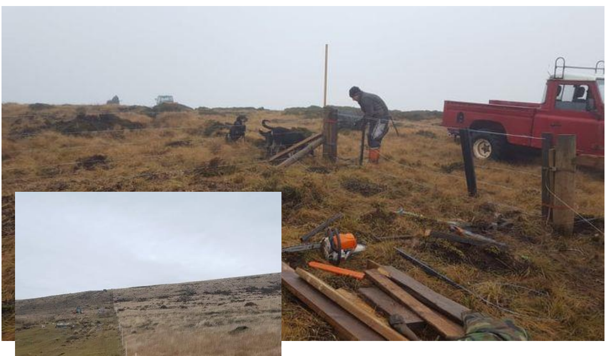
New fences going in

Arrival of materials was delayed due to Covid but all materials are now site, and around two thirds of the fencing has been completed, with the final side to be finished by the end of July with ART funding. Where they existed derelict fences have been removed as the new ones have been installed.