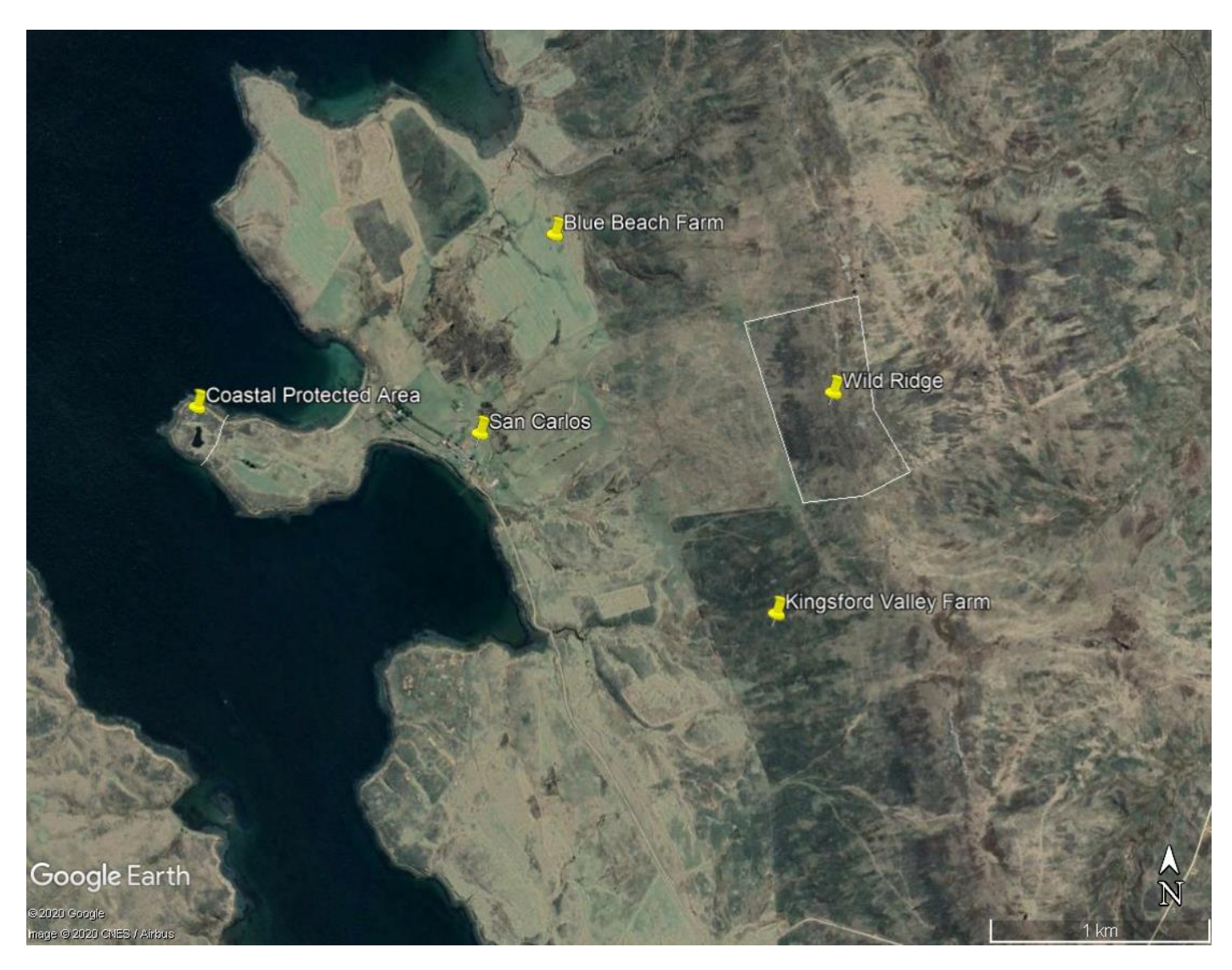
Location of Wild Ridge

With funding from ESB a securely fenced 45 hectare wildlife area has been created at Blue Beach Farm. Livestock will be permanently excluded from the area which includes a mosaic of threatened habitats and is a refuge for plants which are impacted by grazing elsewhere on the farm.