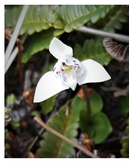
A dog orchid in Wild Ridge

We are very grateful for ESB funding for this area and look forward to hosting visits to the area this summer.