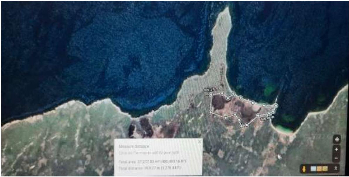
Google Earth Image of the 4.5ha bare ground(3BB) now planted with tussac.