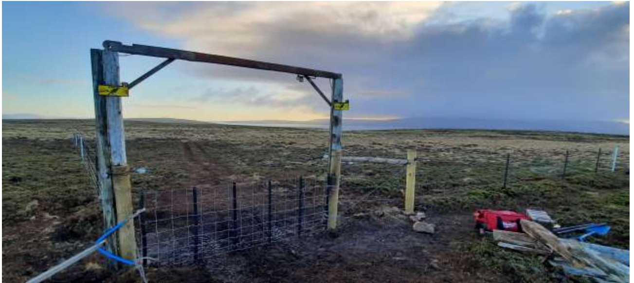
Entrance to South West Point plantations

4. Total tillers planted this winter 2022: 23 442 covering an estimated 5.42 hectares across all plantations on South West Point.