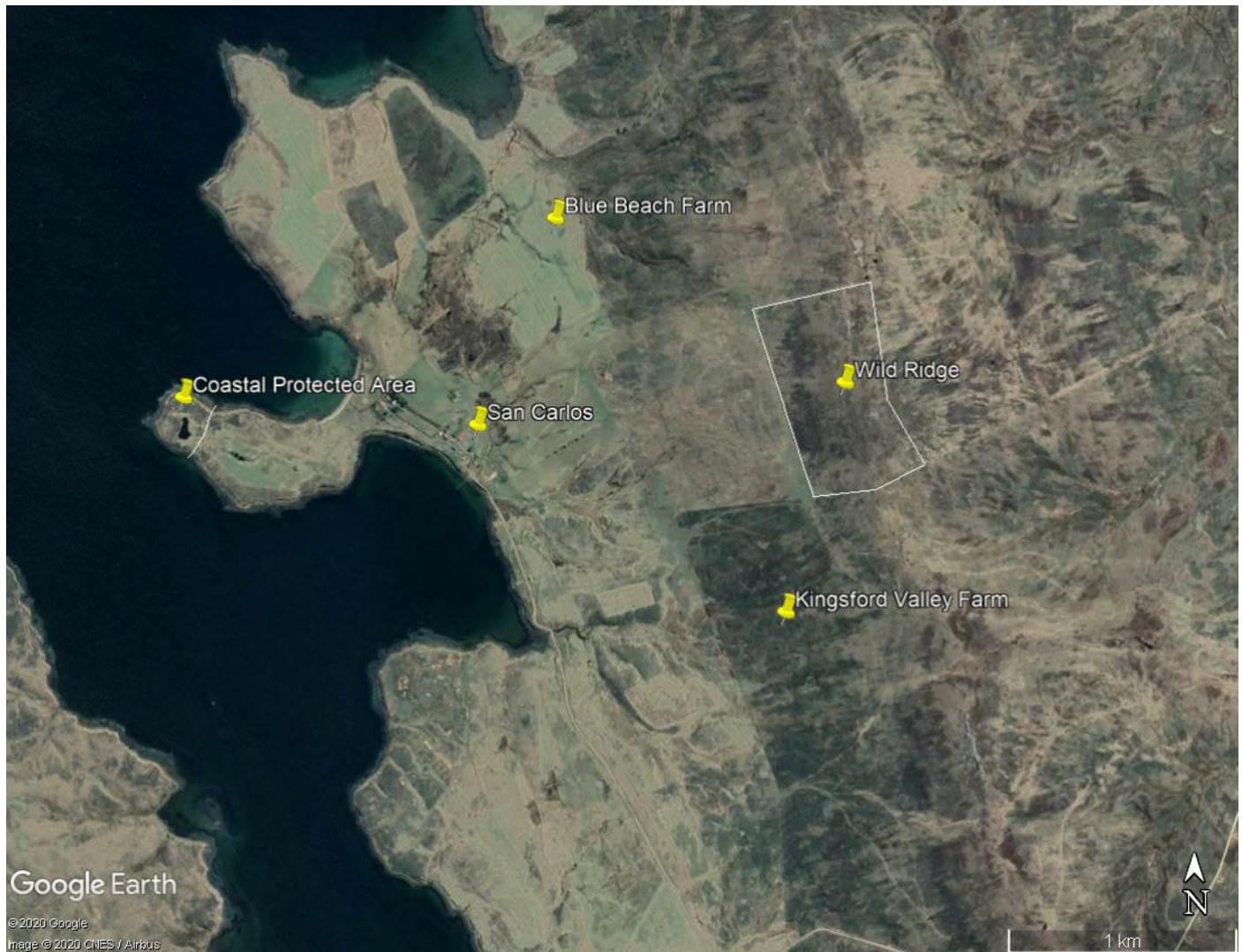
Location of Wild Ridge

With funding from ESB a securely fenced 45 hectare wildlife area has been created at Blue Beach Farm. Livestock will be permanently excluded from the area which includes a mosaic of threatened habitats and is a refuge for plants which are impacted by grazing elsewhere on the farm.