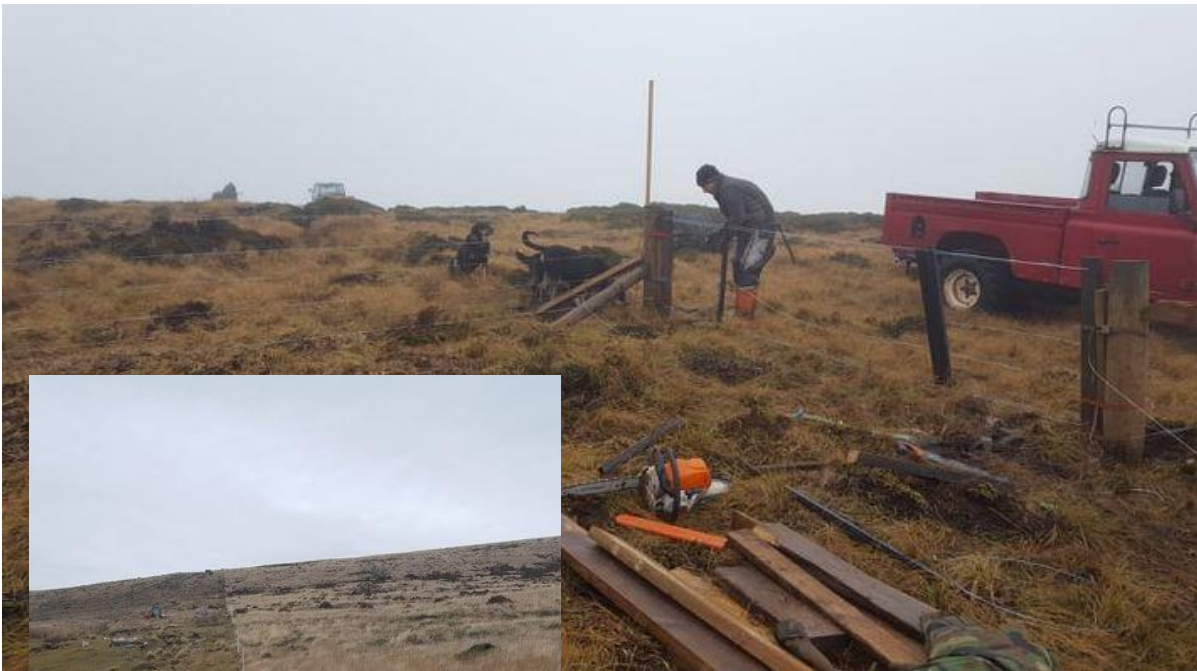
New fences going in

Arrival of materials was delayed due to Covid but all materials are now site, and around two thirds of the fencing has been completed, with the final side to be finished by the end of July with ART funding. Where they existed derelict fences have been removed as the new ones have been installed.