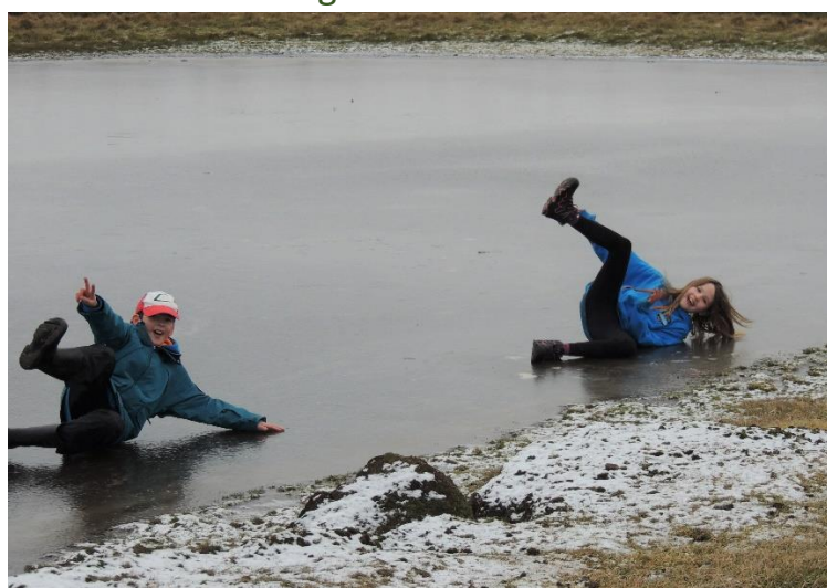
Watch Group visit to Nature Area – the cold did not dampen their spirits!

Educational visits were planned with the Watch Group and teachers from MPC. Unfortunately the weather was poor on both days and it was not possible for the groups to visit Wild Ridge which is quite exposed. However the trips were successfully held in the farm's coastal nature area which is easily accessed by vehicle. Both trips were enjoyed and the participants learned about native habitats of the Falkland Islands. We have also taken a number of ad hoc groups of visitors and San Carlos residents to Wild Ridge when the weather has been good.