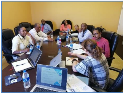
Discussing the structure and function of the Turks & Caicos Islands Environment Strategy with TCIG Departments and Stakeholders

consultations, which began in 2019 and are ongoing. The process could be offered for roll-out to other UKOTs.