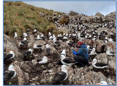
Field Survey – Falkland Islands