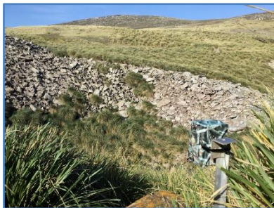
Remote camera set-up, West Point Island

colonies in winter, as has been observed on Bird Island (Falkland Islands) over the past couple of seasons. May open up opportunities for winter studies.