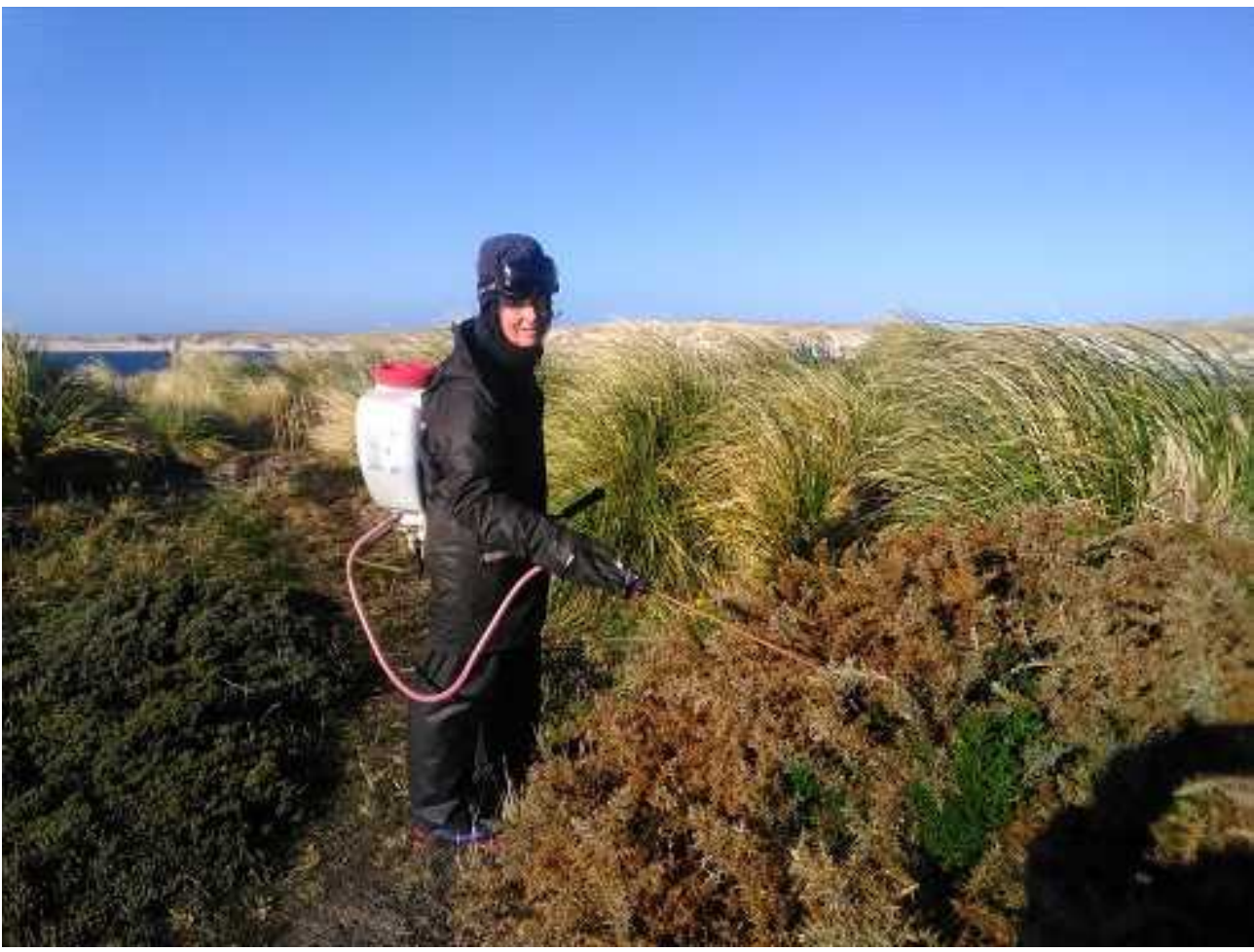
Followup gorse control at Gypsy Cove May 2022