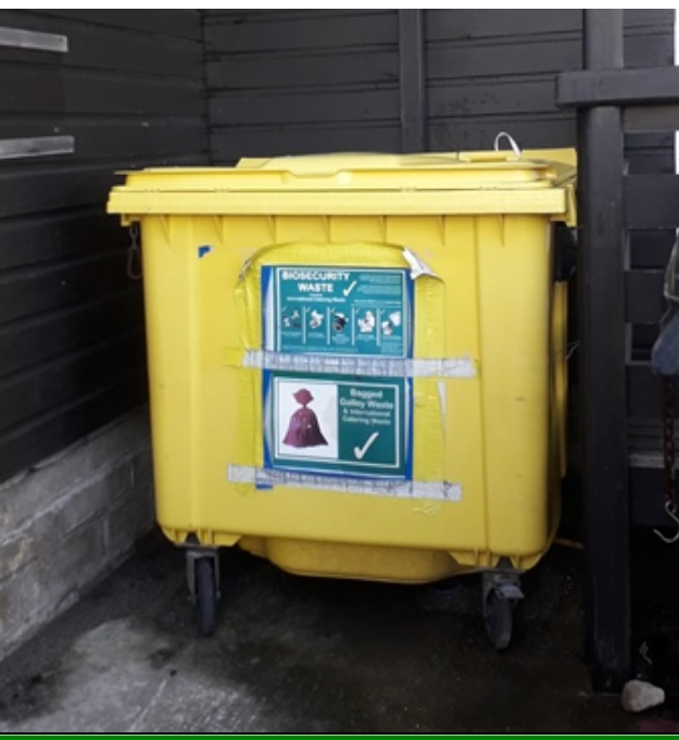
Figure 2: International Catering Waste bins are yellow and marked with an ICW sign.

vessel to depart. Alternatively, ICW can be disposed of at the Department of Agriculture, in bins situated in the corner of the car park (a sign indicates the bin is for biosecurity material).