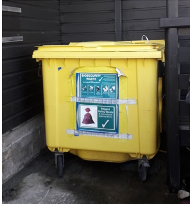
Figure 2: International Catering Waste bins are yellow and marked with an ICW sign.

vessel to depart. Alternatively, ICW can be disposed of at the Department of Agriculture, in bins situated in the corner of the car park (a sign indicates the bin is for biosecurity material).